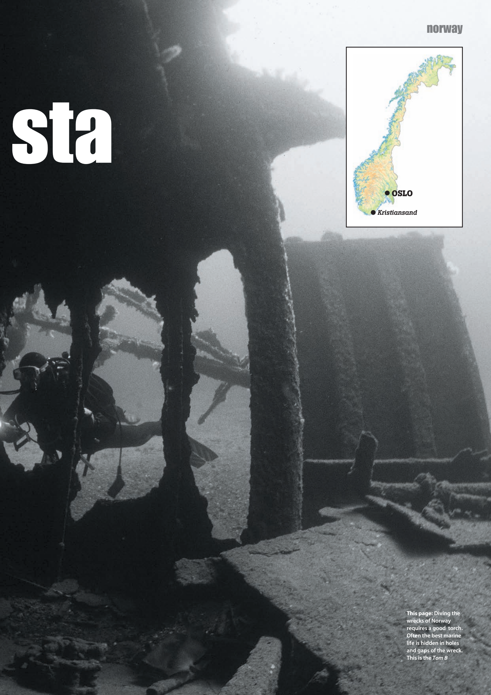
This page: Diving the wrecks of Norway requires a good torch. Often the best marine life is hidden in holes and gaps of the wreck. This is the Tom B