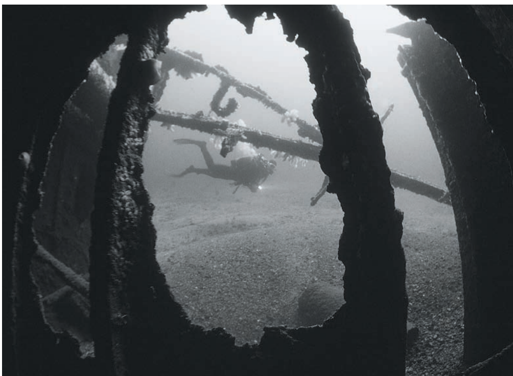
Above right: A quiet day at Kjevik harbour. Below: The Tom B is easy to penetrate as it is both shallow and open

TOURIST INFORMATION: 0207 839 6255, www.visitnorway.com